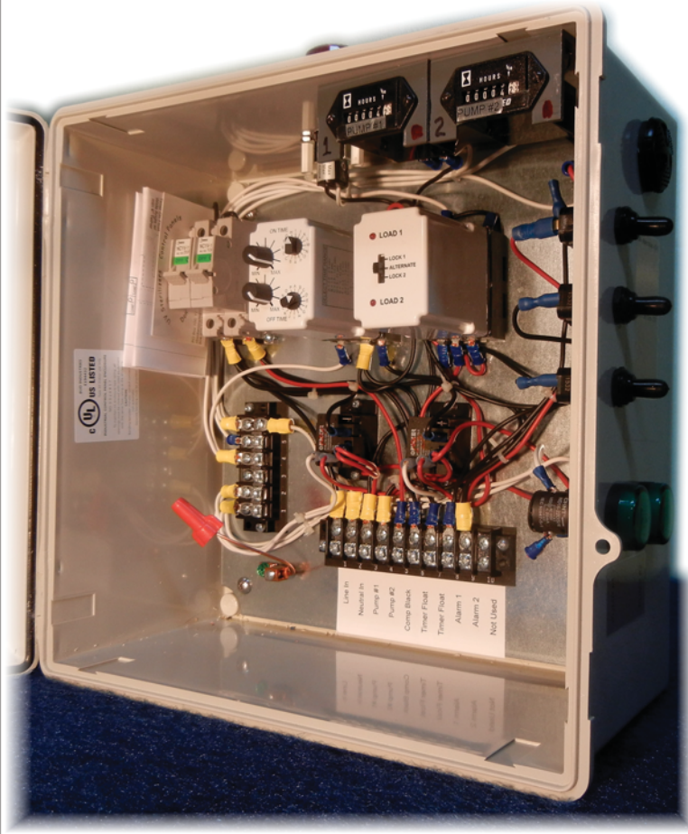
Dimensions: 13" wide x 13" tall x 7" deep